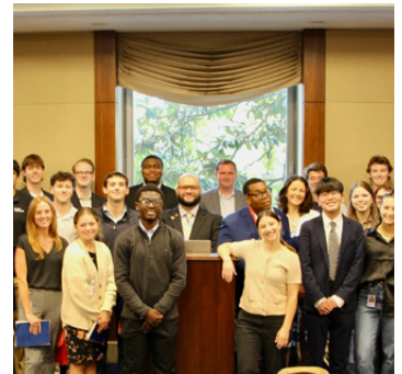
The Committee's Fall cohort of Intern Academy with Committee policy staff. (September 24, 2025)