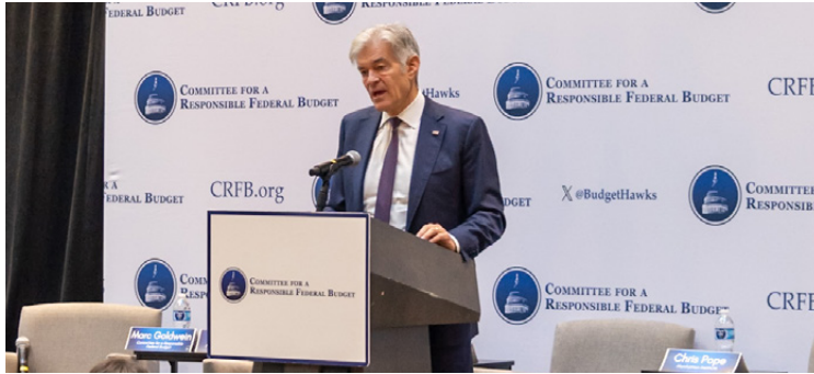
Dr. Mehmet Oz, Administrator for the Centers for Medicare & Medicaid Services, gives the opening keynote address at the Committee's Saving the Trust Funds event. (October 22, 2025)