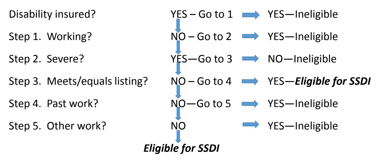
Figure III.1. Current SSDI eligibility criteria

unfamiliar with the current process and criteria, we describe it below. Others may skip to the description of the EES criteria and decision process.